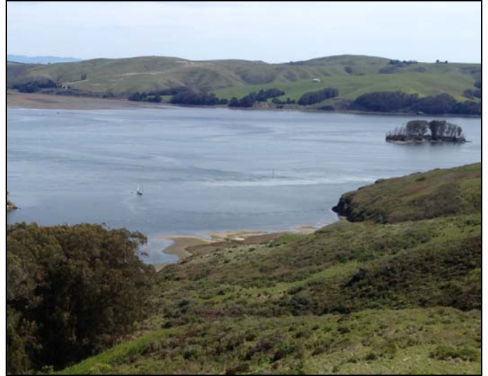
View from Pierce Point Ranch

There are also big things. The restoration of the Giacomini wetlands was a PRNSA project. What a day it was! The dikes were breached and the incoming tide inched its way up to the outskirts of Point Reyes Station. Marshes, ponds, and inlets that had disappeared more than fifty years ago come back, and with them otters, waterfowl, fish and even an occasional bald eagle.