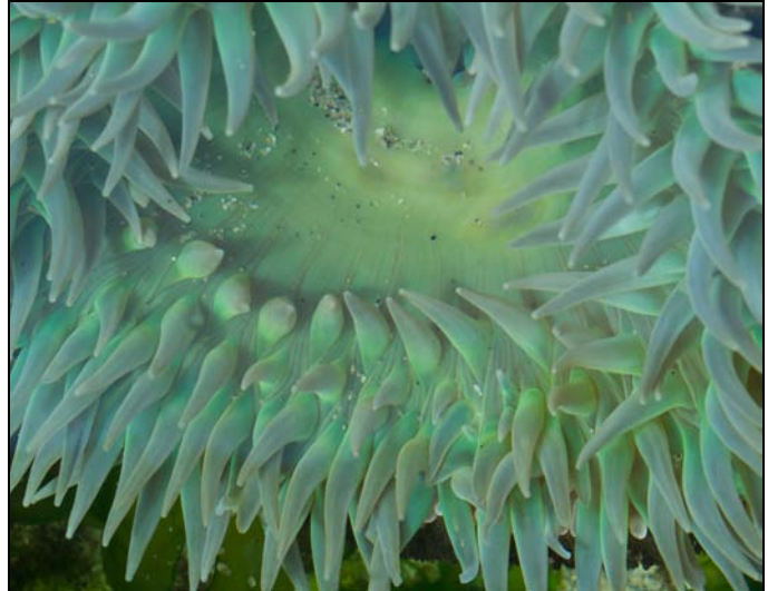
Anemone

If you haven't already done so, please join IRA by sending a $25.00 check to P.O.Box 342, Inverness, CA 94937. And if you are interested in becoming a Board member we meet about six times a year at a member's home, with lots of insightful discussion, decision making, and some laughs. If so, please contact me at my email menace@horizoncable.com